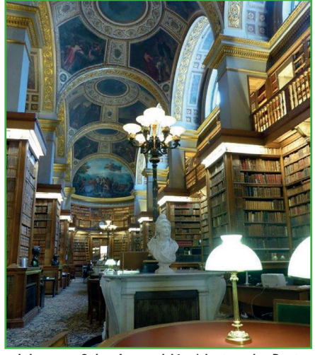
· Library of the Assemblée Nationale, Paris

Depending on the subject dealt with, given libraries can be great starting points. Thus our own Glasgow University Library is the obvious place to start work on emblem literature: the Stirling Maxwell collection is without parallel