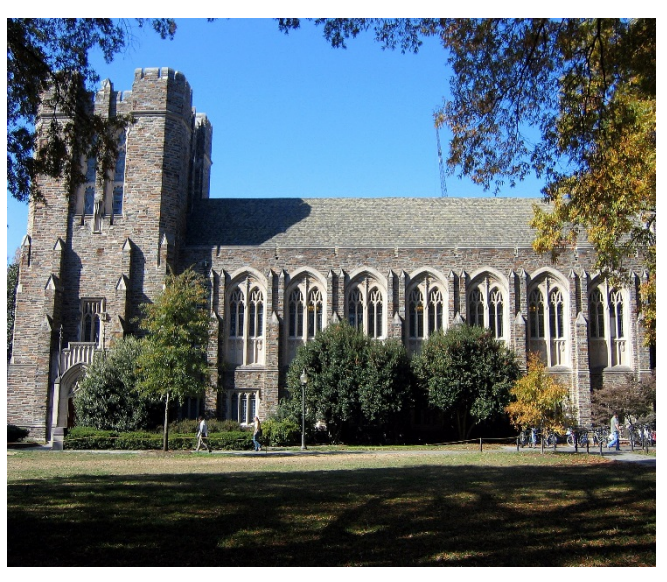
Figure 3. Perkins Library