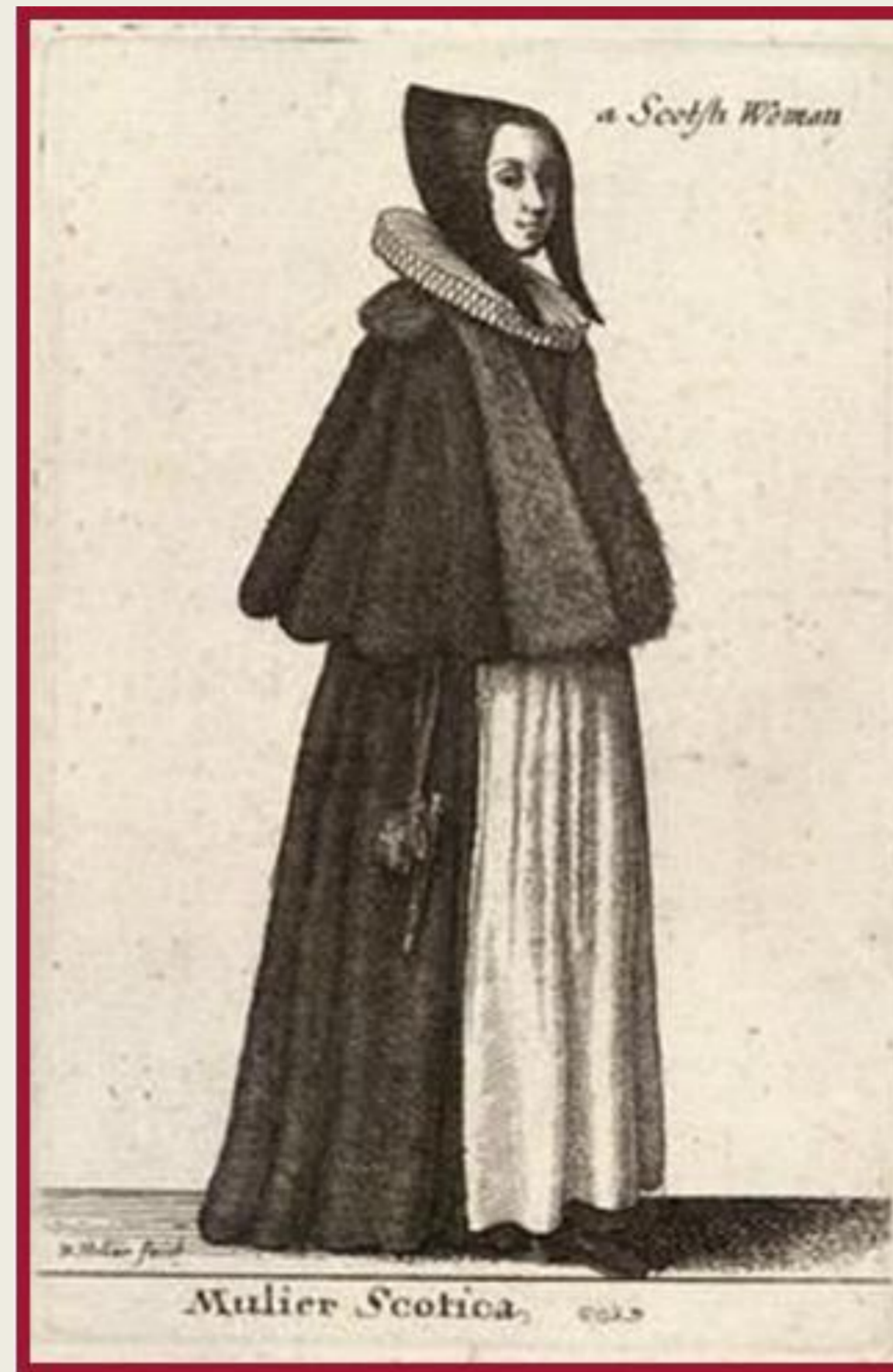
Wenceslaus Hollar, “Mulier Scotica”, Costumes, Theatrum Mulierum And Aula Veneris , Plate Number P1899. 9 x 6 cm.