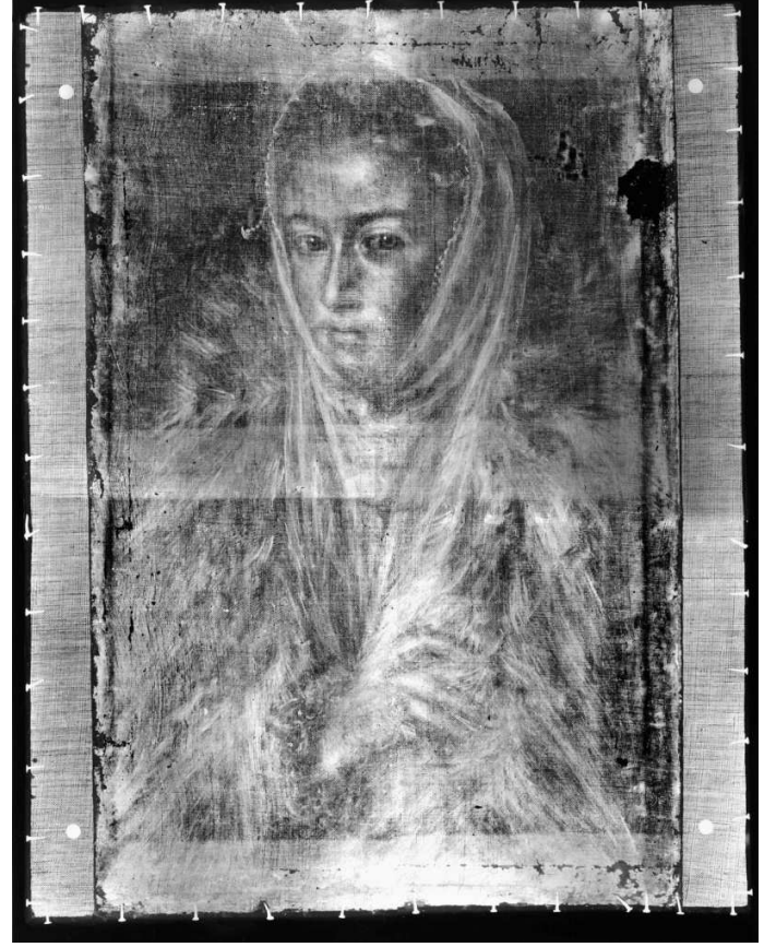
Figs. 8, 10