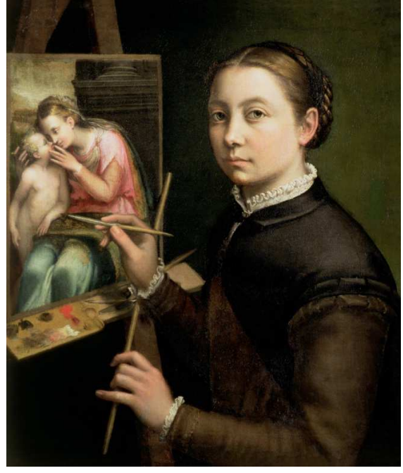
Figs. 3, 9