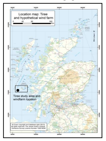
Figure 1. Location of study area and hypothetical windfarm.

The study area was the area around the island of Tiree on Scotland's west coast, which is approximately 12 miles long by 3 miles wide with a population of about 750.