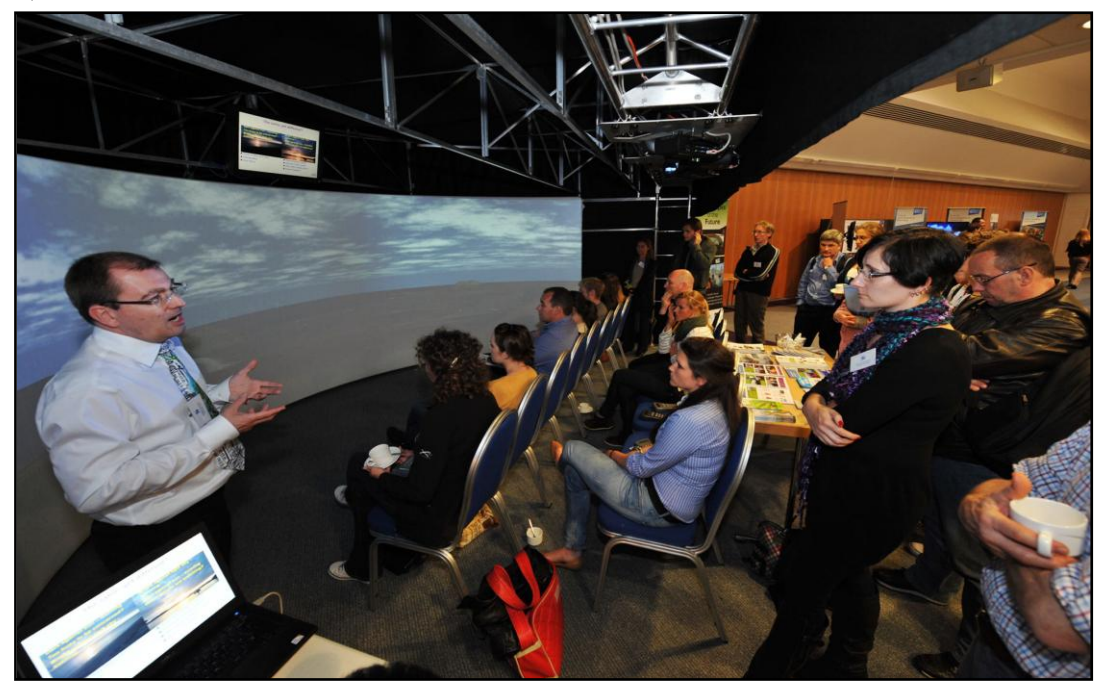
Figure 4. Audience discussion over the different options for windfarms offshore of Tiree.

Findings from use of the prototype are being used to develop tests to consider the potential significance of sea state with respect to view characteristics, and the significance of different lighting conditions and turbine layouts on people's landscape preferences (Bishop and Miller, 2007).