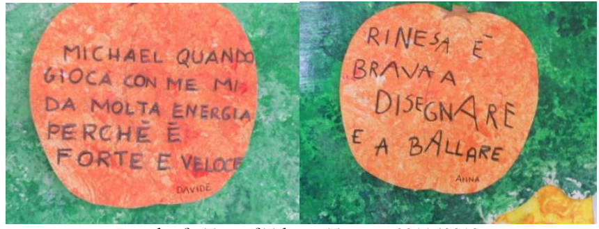
Details of a Tree of Talents (Treviso, 2011/2012)